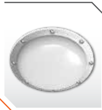
Heavy Duty Fixtures