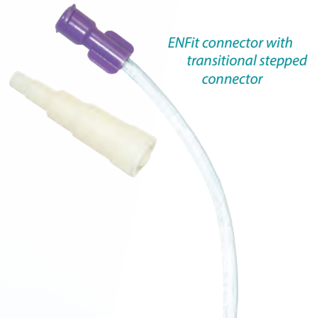
ENFit connector with transitional stepped connector