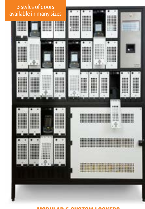
MODULAR & CUSTOM LOCKERS Configured to your asset specifications