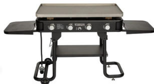
QUISINART Outdoor Gas Griddle