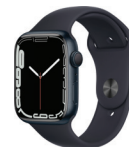
APPLE Watch Series 7