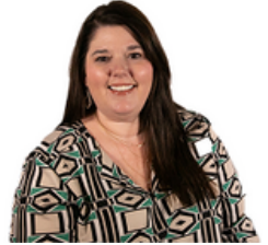
Sr. Vice President