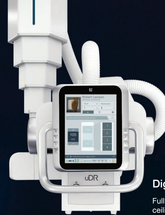
Digital Radiography (DR)

Elegant and modern design enhances patient comfort and safety.