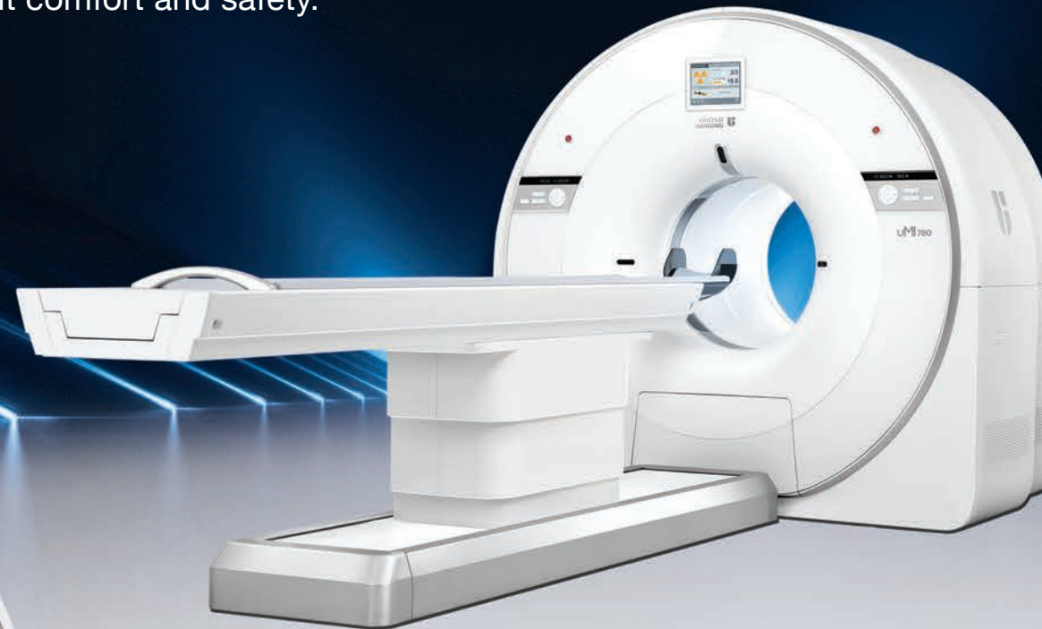
Molecular Imaging (PET/CT)

Fully automated floor- and ceiling-mounted systems