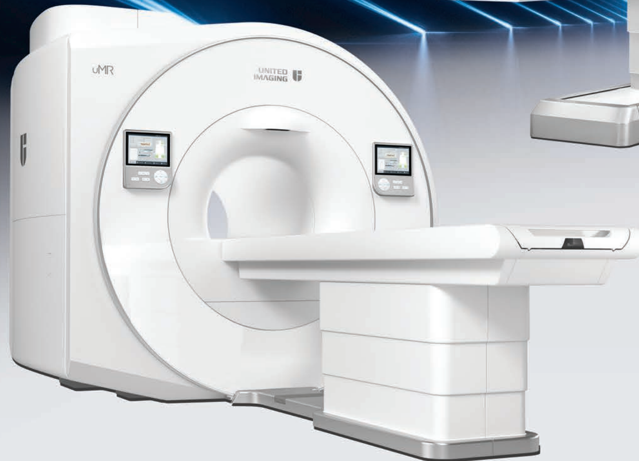
Magnetic Resonance Imaging (MRI)

All digital, axial field of view 24 to 194 cm