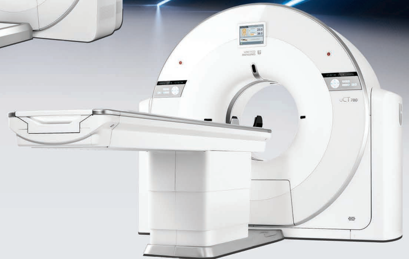
Computed Tomography (CT)

Fast and high-quality 1.5T and 3T imaging