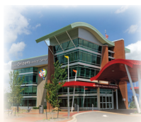
Norton Children's Medical Center