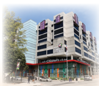
Norton Children's Hospital