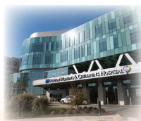
Norton Women's & Children's Hospital