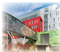
Novak Center for Children's Health