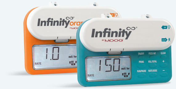
Both the Infinity Orange and Infinity feeding pumps are designed for maximum portability, usability, and safety.

Moog is different. Our sole focus is on pumps and delivery sets. Our sales team is made up of industry experts that only sell enteral feeding products. Our entire organization is dedicated to delivering enteral-related solutions to you, our customers.