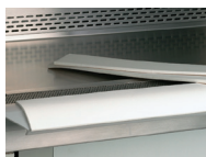
Foam Armrest Pads