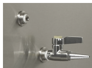
Additional Service Valve