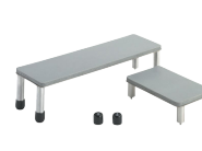
Padded Elbow Rests 5 or 10 in [127 or 254 mm]