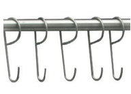
IV Bar + 6 SST Hooks