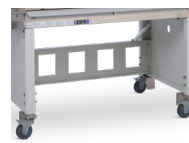
Base Stand Casters (Must Order Base Stand)