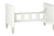
Base Stand Shelf (Must Order Telescoping Base Stand)