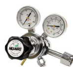
Two-Stage CO 2 Regulator

If you purchase any In-Vitrocell CO 2 Incubator , you will receive 1 FREE accessory of your choice per purchase: