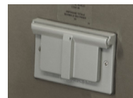
Duplex GFCI Outlet