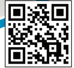
RING BLACK COATED