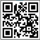
RING RAINBOW COATED