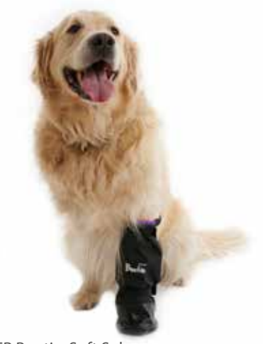
BUSTER Bootie, Soft Sole

The soft sole version is recommended for use with soft bandages after a paw injury or for post-operative care for a few weeks of use.