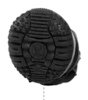
Soft, flexible and strong rubber sole

Available in 8 sizes and a starter pack.