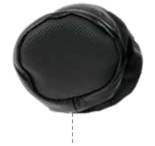
Light, flexible and durable