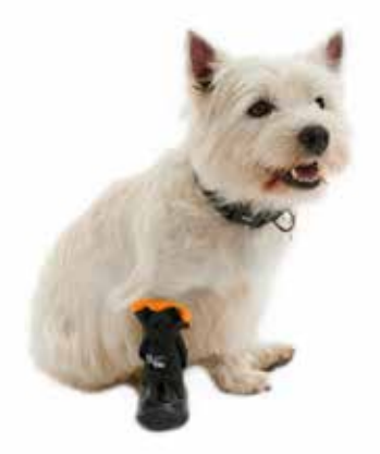
BUSTER Bootie, Hard Sole

The hard sole is recommended for patient injuries requiring a heavier splint or a thicker bandage for more than a few weeks.