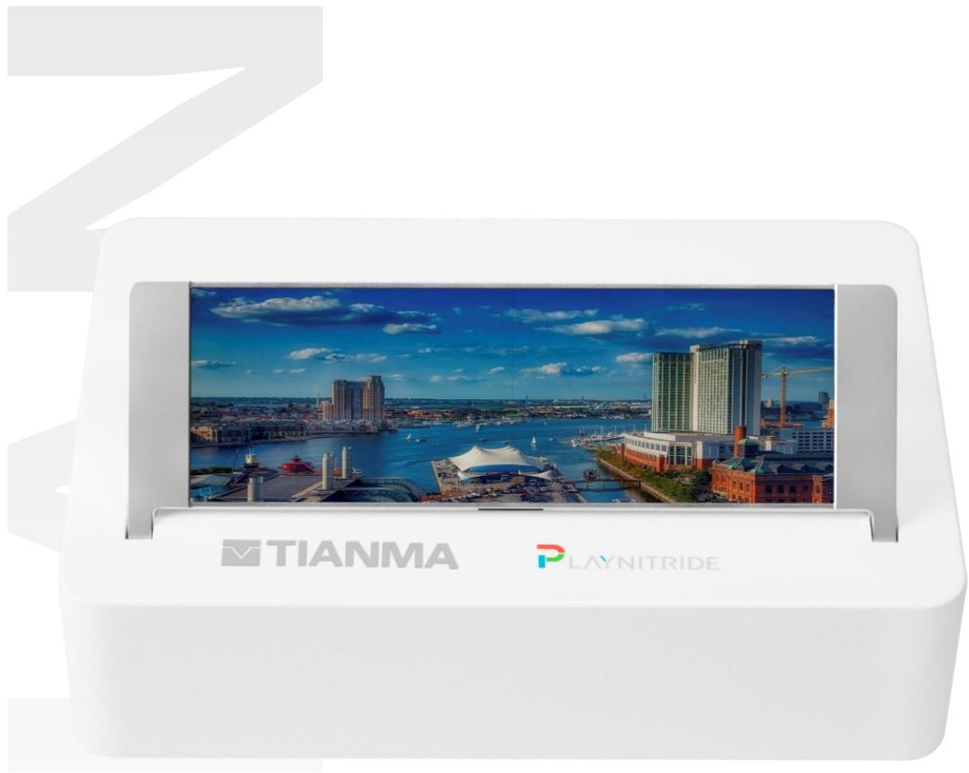
5.04" X2 Splicing