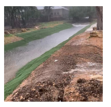
CHANNELS, SWALES & STREAMBANKS Immediate green, grass-like appearance, permanent rock-like erosion protection.