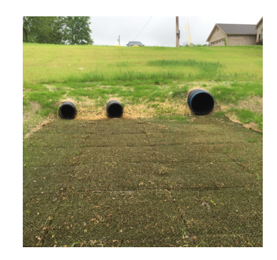
OUTFALL AREAS Rock-free, easy-to-maintain scour protection.