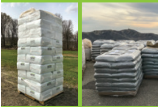
Standard hydromulch pallet 96" H

Shorter pallet height – easy to transport, ability to load full 1 ton pallet on top of hydro-seeder without unpacking.