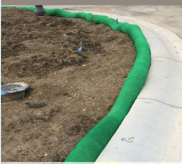
FILTREXX SILT SOXX®