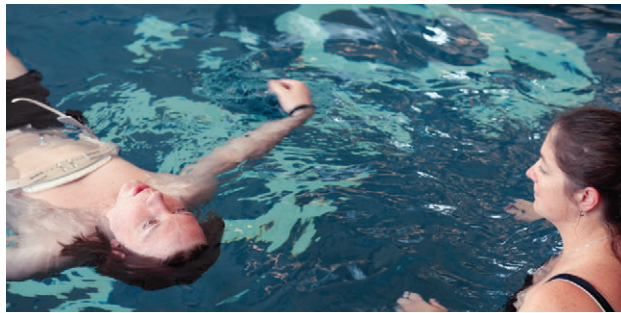
Craig offers pool therapy for many patients who have been cleared by their physician.

Pool Therapy: Craig Hospital has two state-of-the-art therapy pools for aquatic therapy — physical therapy that takes place in a pool with certified specialists. At Craig, aquatic therapy is for medically stable patients and uses water as a medium for increasing strength, endurance and range of motion.