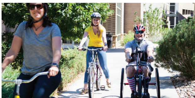
Each Craig patient has a therapeutic recreation specialist on their team.