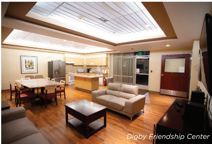
Digby Friendship Center