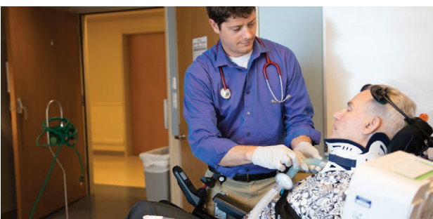
Respiratory therapists at Craig work with SCI patients on ventilators.

Ventilator-Dependent and Weaning Programs: Craig's Respiratory Care Department has been working with ventilator-dependent patients with spinal cord injury during rehabilitation for more than three decades. Our ventilator weaning program is extremely successful, with an excellent reputation for comfortably weaning patients off mechanical ventilation while they are undergoing rehabilitation.