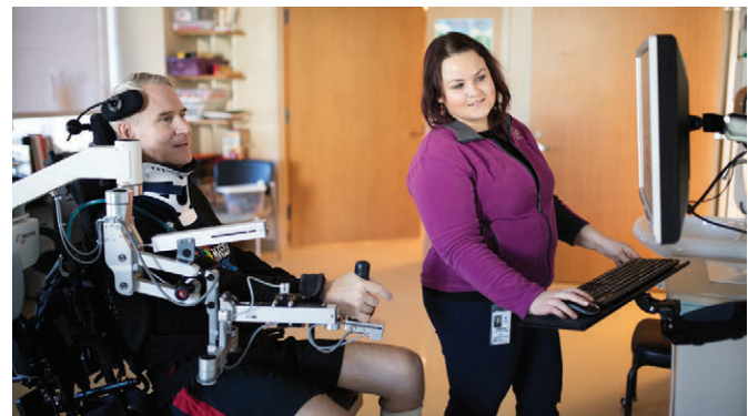
Craig's Upper Extremity Lab provides range-of-motion technology in the hands and helps people be more independent with activities of daily living.