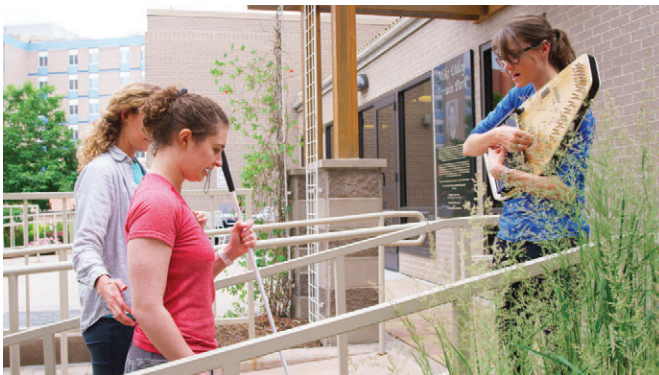
The neurologic music therapy program at Craig Hospital aims to provide live-music experiences to facilitate recovery of nonmusical functions.

Craig's Patient/Family Housing building has a hospitality center with an adjoining barbecue area and conference room. Reserve time slots (up to three hours) for the Digby Friendship Center in Therapeutic Recreation.