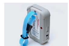
Cleanable plastic strap