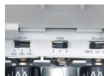
Volume, Tone, and Delay controls are kept out of sight in the battery compartment

ALERTS show when to replace the batteries or sensor pad and if there is a lost signal.