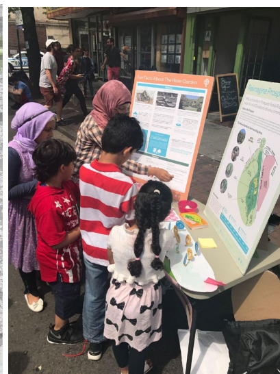
Community-center design activities guiding future capital efforts