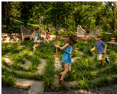
Bracken Foundation Children's Garden