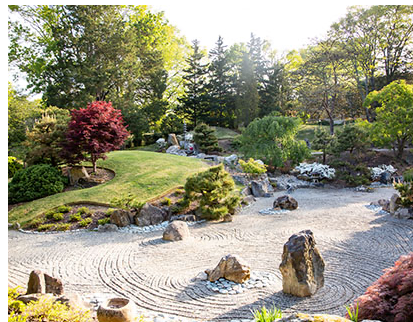
Blevins Japanese Garden