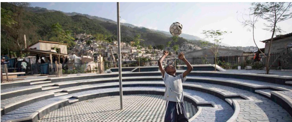
Tapis Rouge public space, EVA Studio