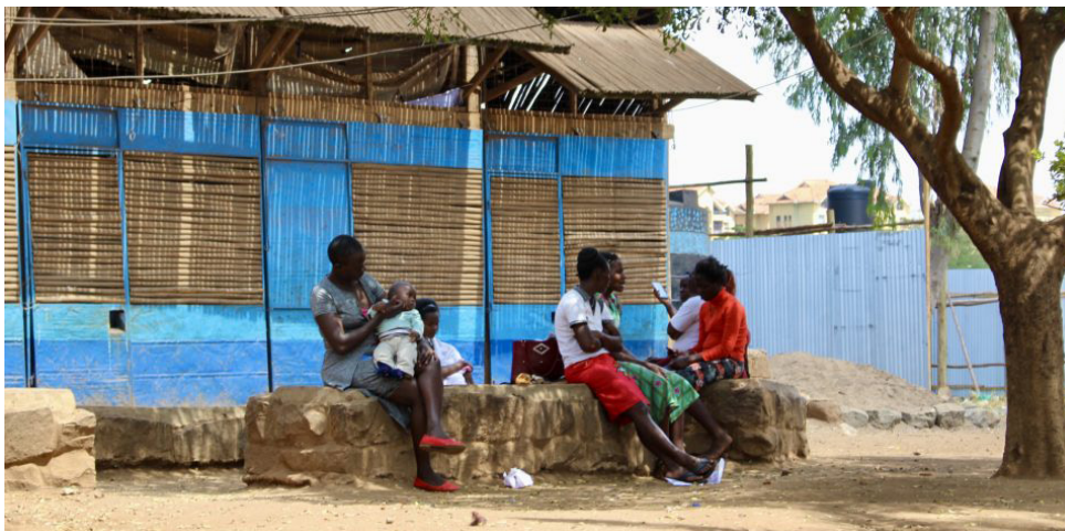
Kibera Public Space Project, KDI