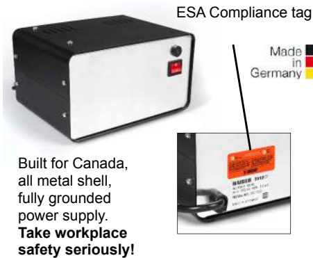
ESA Compliance tag

Built for Canada, all metal shell, fully grounded power supply. Take workplace safety seriously!