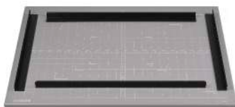
KA-5901 Kaiser Copy Plate