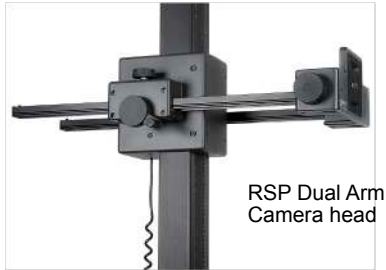
RSP Dual Arm Camera head