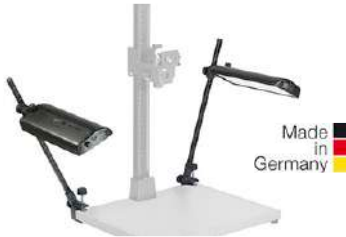
KA-5551 RB 550 AL LED

Includes: removable diffusers. Each light can be dimmed individually or together from 10% to 100% in 1% increments. Solid aluminum main housing