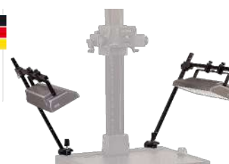
KA-565601 - RB 5056 HF lighting

Supplied as a set of 2 barn doors for one CopyOne light