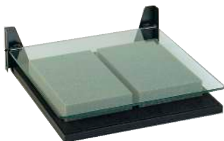
KA-5904 Kaiser Book Holder