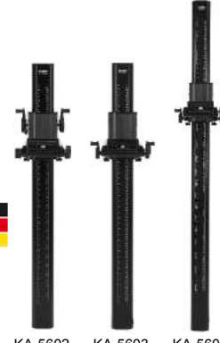
KA-5602 KA-5603 KA-5600

Camera Arm: +/- 90° tilt, blocking screws, Horizontal adjustment