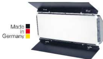
KA-5671 - CopyOne single lamp head

*Hensel Nova D power supply sold separately