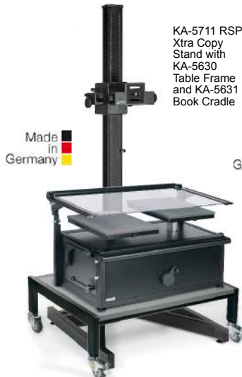
KA-5711 RSP Xtra Copy Stand with KA-5630 Table Frame and KA-5631 Book Cradle