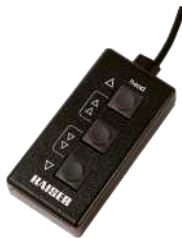
RSP Dual speed camera control