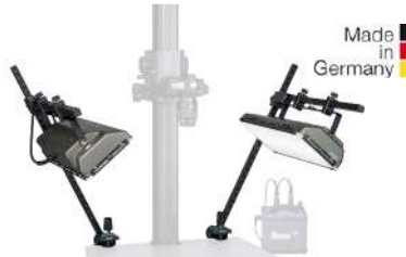
KA-5660 - CopyOne Repro Kit

Arms / clamps: Steel tube with square cross section, tilt, angle, height adjustable