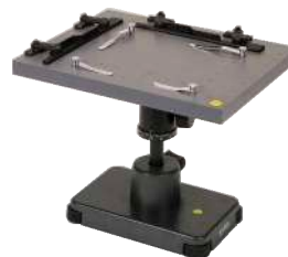
KA-5903 Kaiser Document stage