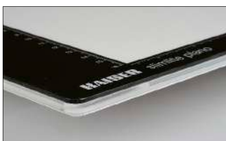
KA-2454 Slimlite Plano Medium

Illuminated area: 22 x 16 cm / 8.7 x 6.3 in. Light source: 23 LEDs, Colour Temp: Approx. 5000 K Output quality: CRI=95 Luminosity: approx. 750 cd/m 2 Power consumption: 3.6 W Li-ion battery: 1050 mA Operating time: approx. 5 hours at full power Dimensions: 29 x 0.8 x 20 cm 11.4 x 0.3 x 7.9 in. Weight: 570 g / 20.1 oz.