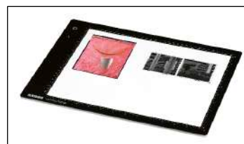
KA-2455 Slimlite Plano Large

Illuminated area: 32 x 22.8 cm / 12.6 x 9 in. Light source: 23 LEDs, Colour Temp: Approx. 5000 K Output quality: CRI=95 Luminosity: approx. 600 cd/m 2 Power consumption: 4.1 W Li-ion battery: 1050 mA Operating time: approx. 3.5 hours at full power Dimensions: 39 x 0.8 x 27 cm 15.4 x 0.3 x 10.6 in. Weight: 1010 g / 35.6 oz.