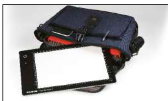
KA-2453 Slimlite Plano Small

Illuminated area: 22 x 16 cm / 8.7 x 6.3 in. Light source: 23 LEDs, Colour Temp: Approx. 5000 K Output quality: CRI=95 Luminosity: approx. 750 cd/m 2 Power consumption: 3.6 W Li-ion battery: 1050 mA Operating time: approx. 5 hours at full power Dimensions: 29 x 0.8 x 20 cm 11.4 x 0.3 x 7.9 in. Weight: 570 g / 20.1 oz.