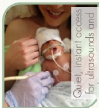
Quiet, instant access for ultrasounds and other interventions