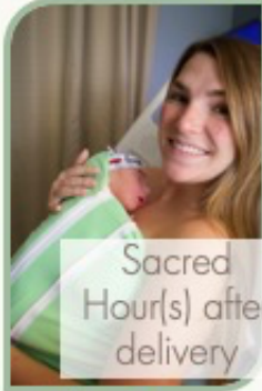
Sacred Hour(s) after delivery