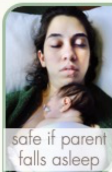
safe if parent falls asleep