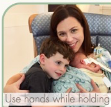
Use hands while holding