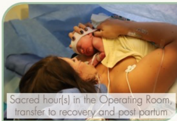
Sacred hour(s) in the Operating Room, transfer to recovery and post partum