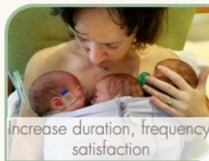
Increase duration, frequency, satisfaction