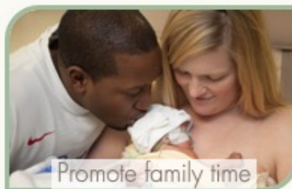
Promote family time