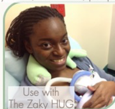
Use with The Zaky HUG