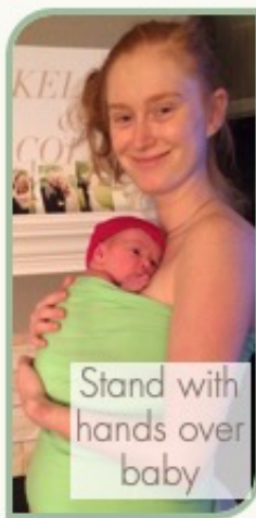
Stand with hands over baby