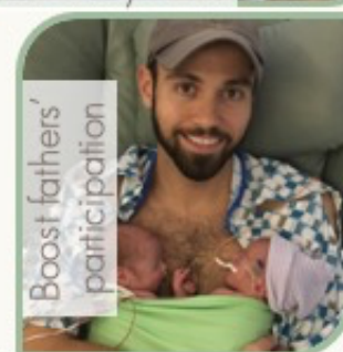
Boost fathers' participation