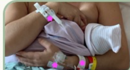
Partially open zipper to let baby move, breastfeed, pump.