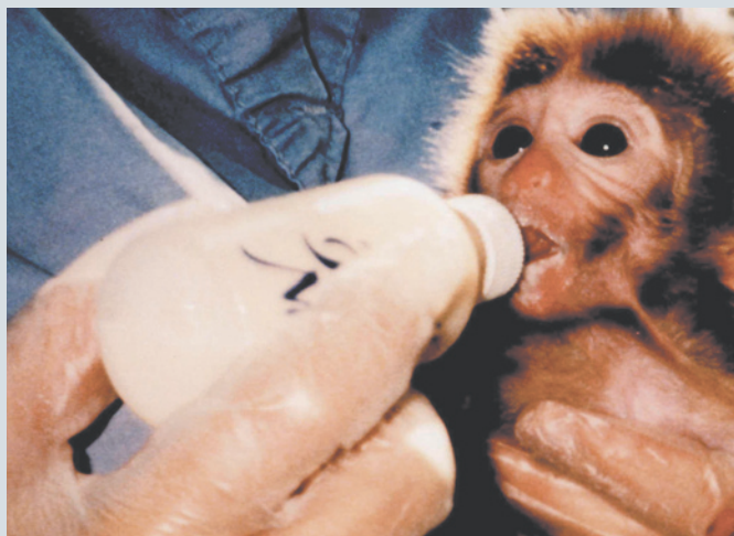
FIGURE 2 | Primilac™ is a milk substitute specially developed for the metabolism and nutritional needs of infant New and Old World primates.

Post-operative care and dehydration require special intervention. Bio-Serv has developed several products to help animals through the critical post-operative phase and bring them back to health. Soft diets, including Bacon Softies for rodents and PRIMA-Burgers™, Monkey Dough™ and Banana, Cherry and