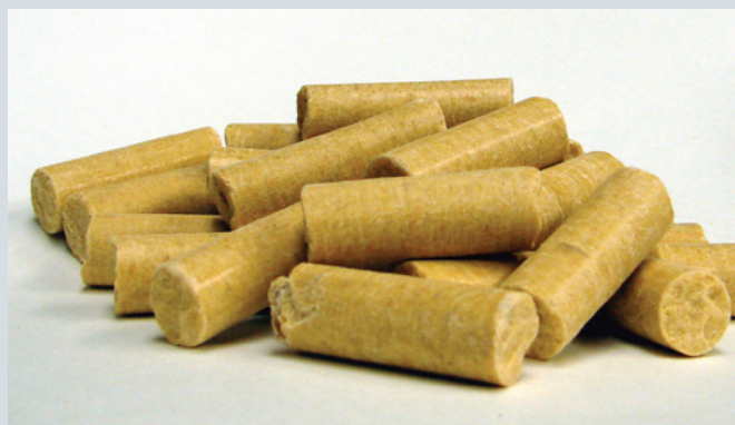
FIGURE 3 | The Sensitive System Diet™, made with easily digestible ingredients not typically found in monkey chow, is made for primates suffering from digestive upset.

Marshmallow Softies for non-human primates, are excellent nutritional options that stimulate appetite in anorexic animals. These highly palatable and nutritious diets replenish essential nutrients. PRANG™ is an electrolyte replacement drink to be used for non-human primates and rabbits that need critical rehydration therapy. PRANG is available in six fruit flavors and contains three times the electrolytes found in Gatorade. To ensure freshness, PRANG is sold in powder form and mixed with water before being offered to animals.