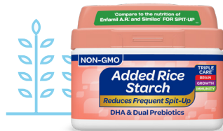
added rice infant formula

Whether a family shops at Target or Walmart, CVS or Walgreens, Amazon or Costco, they can be sure that all Store Brand Infant Formulas meet the same high-quality standards.