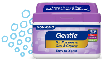
partially hydrolyzed protein