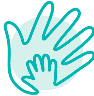
Child & Family Services