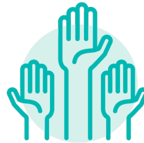
Other Human Services