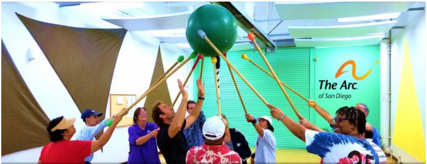
Group Exercise Programming / Inclusive Solutions / Social Connectivity / Personalized Progress