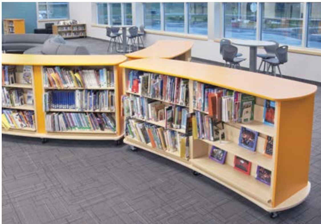
Brodart Contract OTB mobile Performance and Bookspace shelving, Artcobell Discover cafe height tables and stools, HON basyx lounge with Flock ottomans, and Arold Hip Hop lounge.