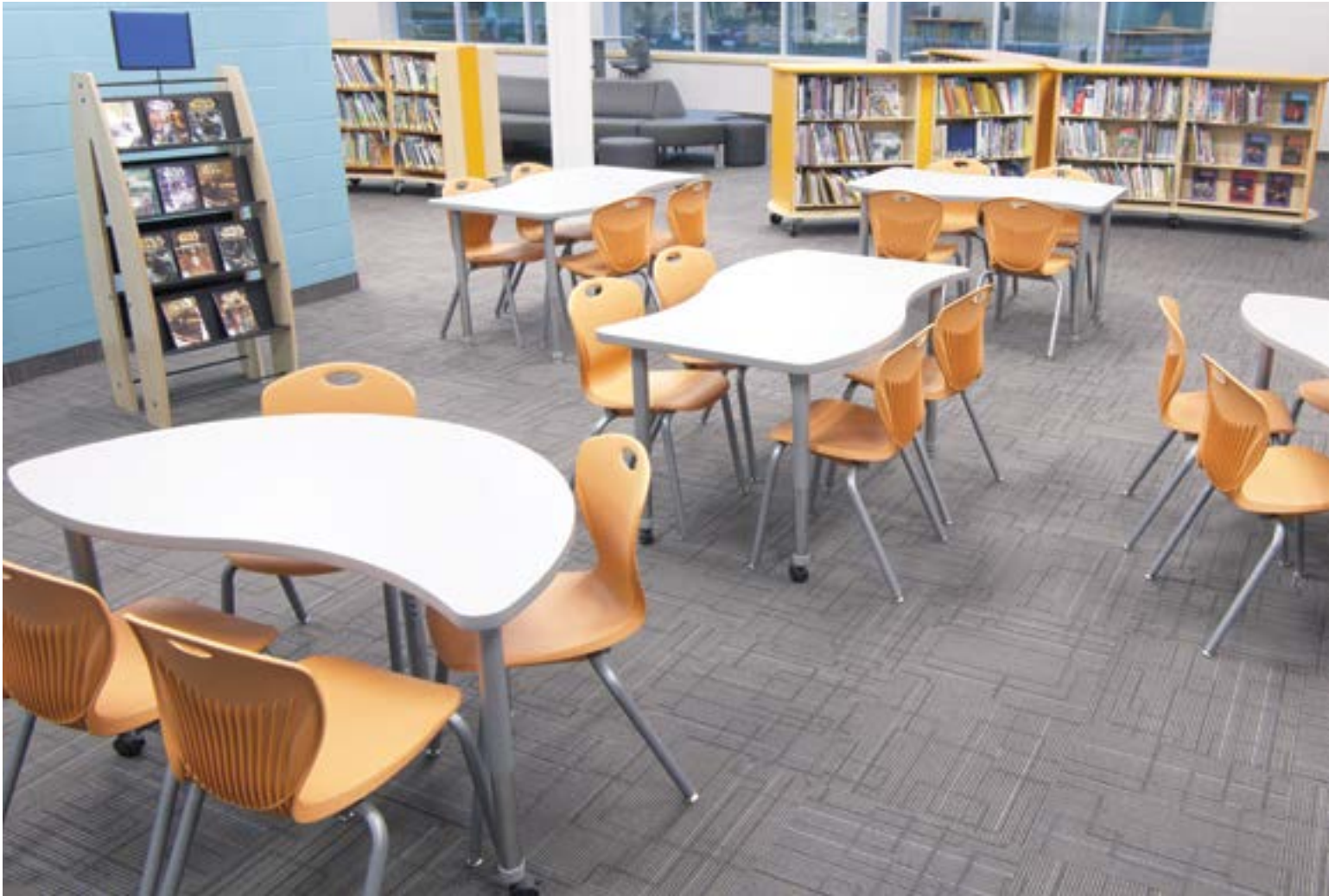
Artcobell Discover Expanse and Nebula tables with casters on one end allow for quick and easy mobility and reconfiguration.