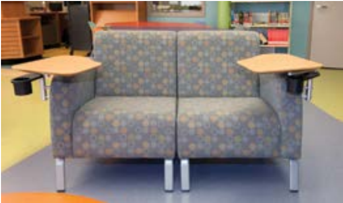
Mobile furniture options is key when creating learning spaces where students can work independently or in groups.