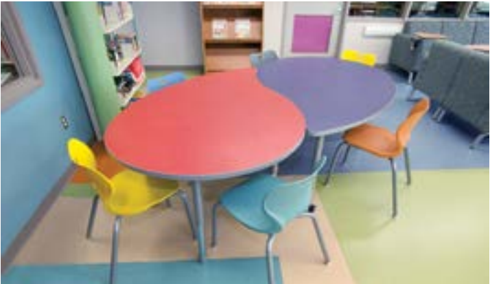
Artcobell shaped tables create different configurations.