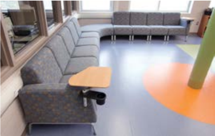
Bretford Motiv lounge seating with tablet arms. Power option is available.