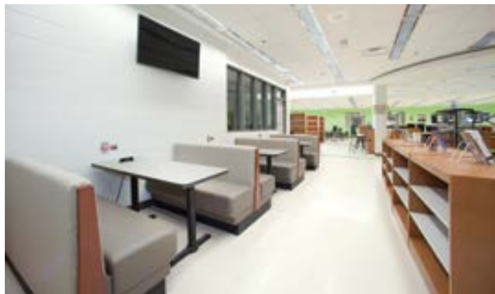
Facility-Concepts Inc. booth seating with power integrated in the top.