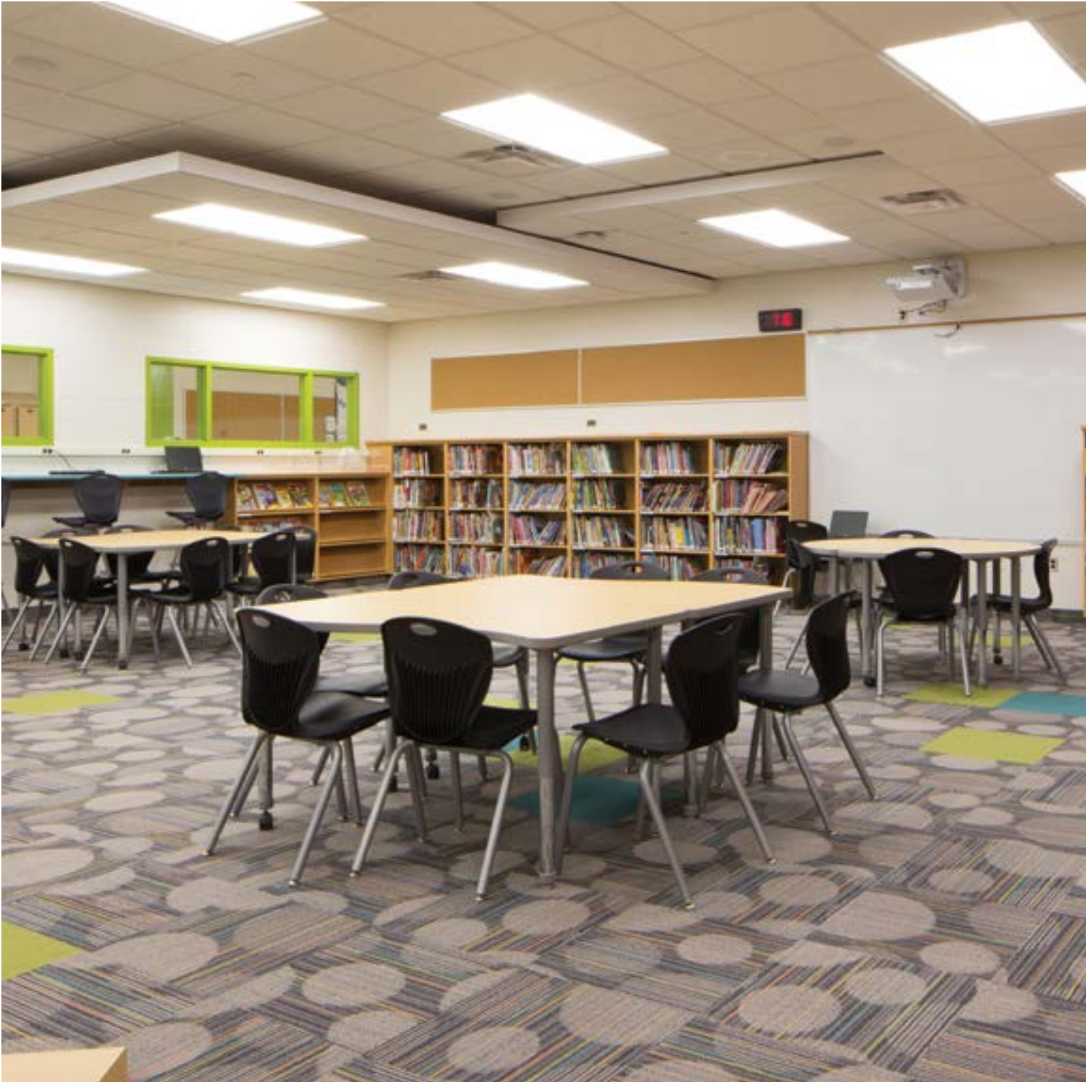
Artcobell Discover tables and chairs with Brodart Contract wood shelving. HON Flock mobile lounge, wall mounted countertop and National Furniture Reno lounge with tablet arms.