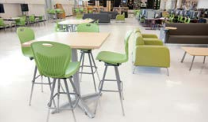
HON Preside cafe table with Artcobell Discover stools.