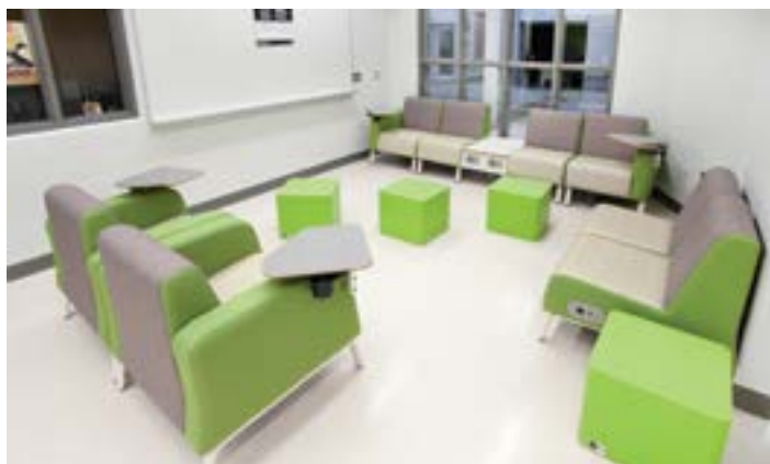
Bretford Motiv lounge with Power and Tenjam cubes.