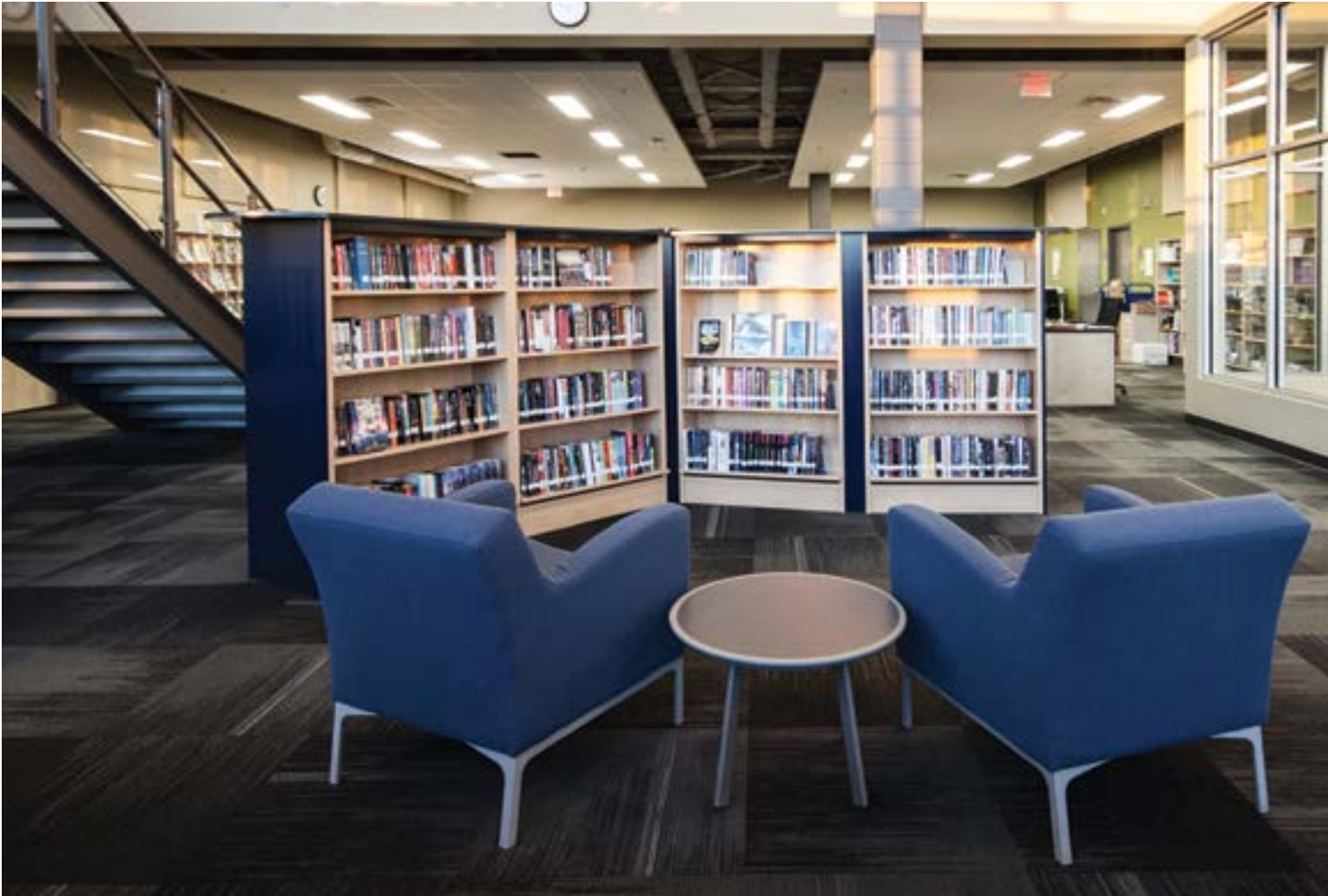
Brodart Contract Opening the Book Performance shelving with Bretford Plus lounge seating and side table.