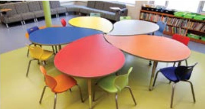
Artcobell Discover Rain shape tables with Alphabet chairs.