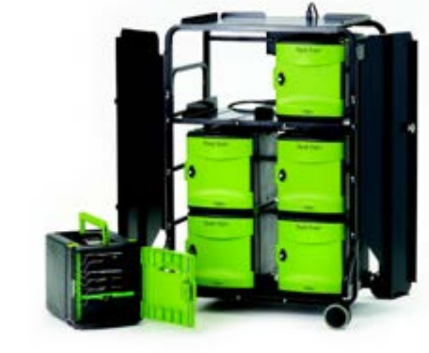
Copernicus Tech Tub Lock. Charge. Sync. It really is that simple. Tech Tub is a compact solution designed to support various mobile devices.