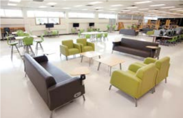
Bretford Motiv lounge with and without power.