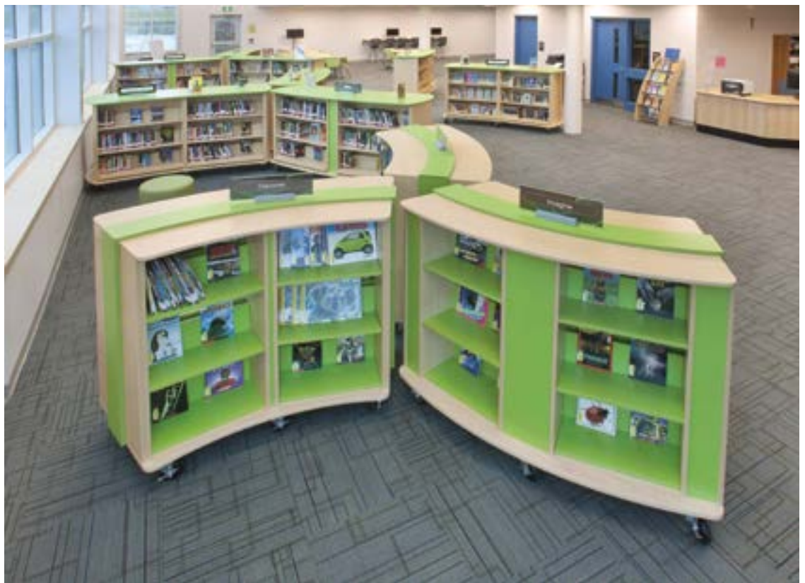
Brodart Contract OTB Bookspace mobile shelving.