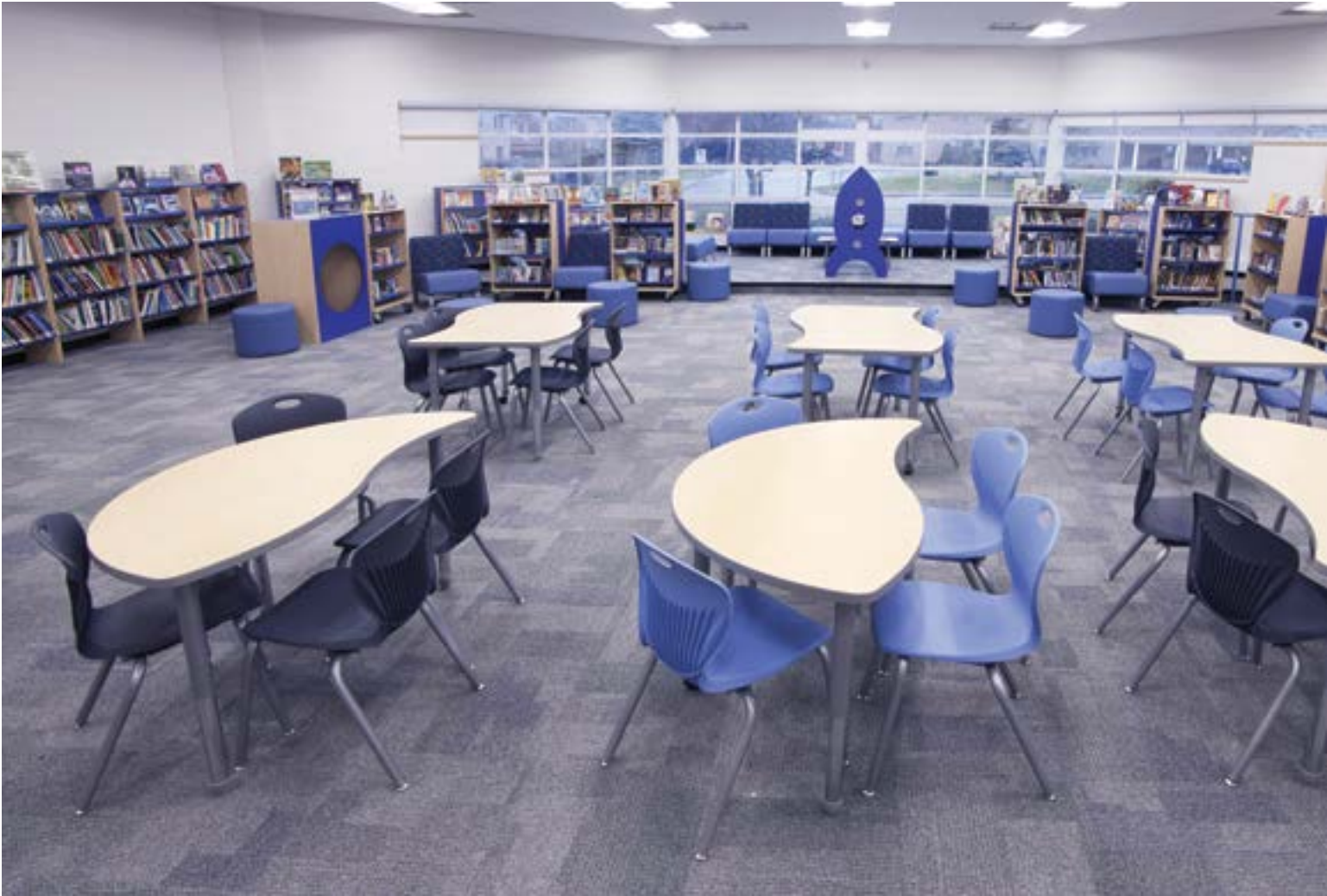
Artcobell Discover Expanse and Nebula tables with Discover chairs. Brodart Contract OTB Bookspace shelving and display furniture.