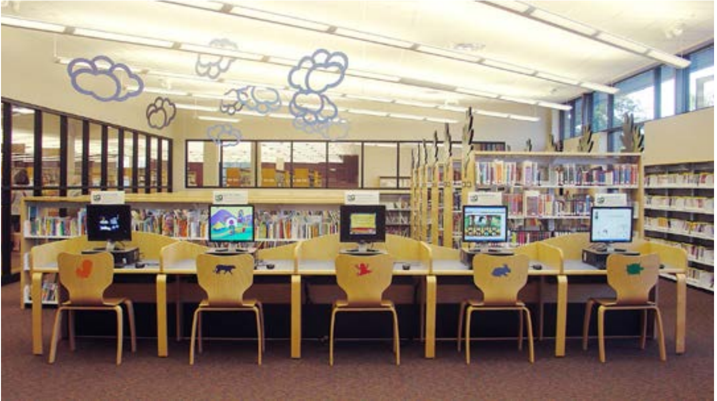
TMC Furniture Plover wood chairs and Wheatland wood carrels with Plover leg design.