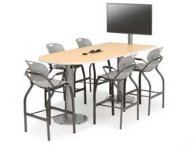
Bretford Explore Cafe Height Teaming Table Group work and collaboration at a standing height.