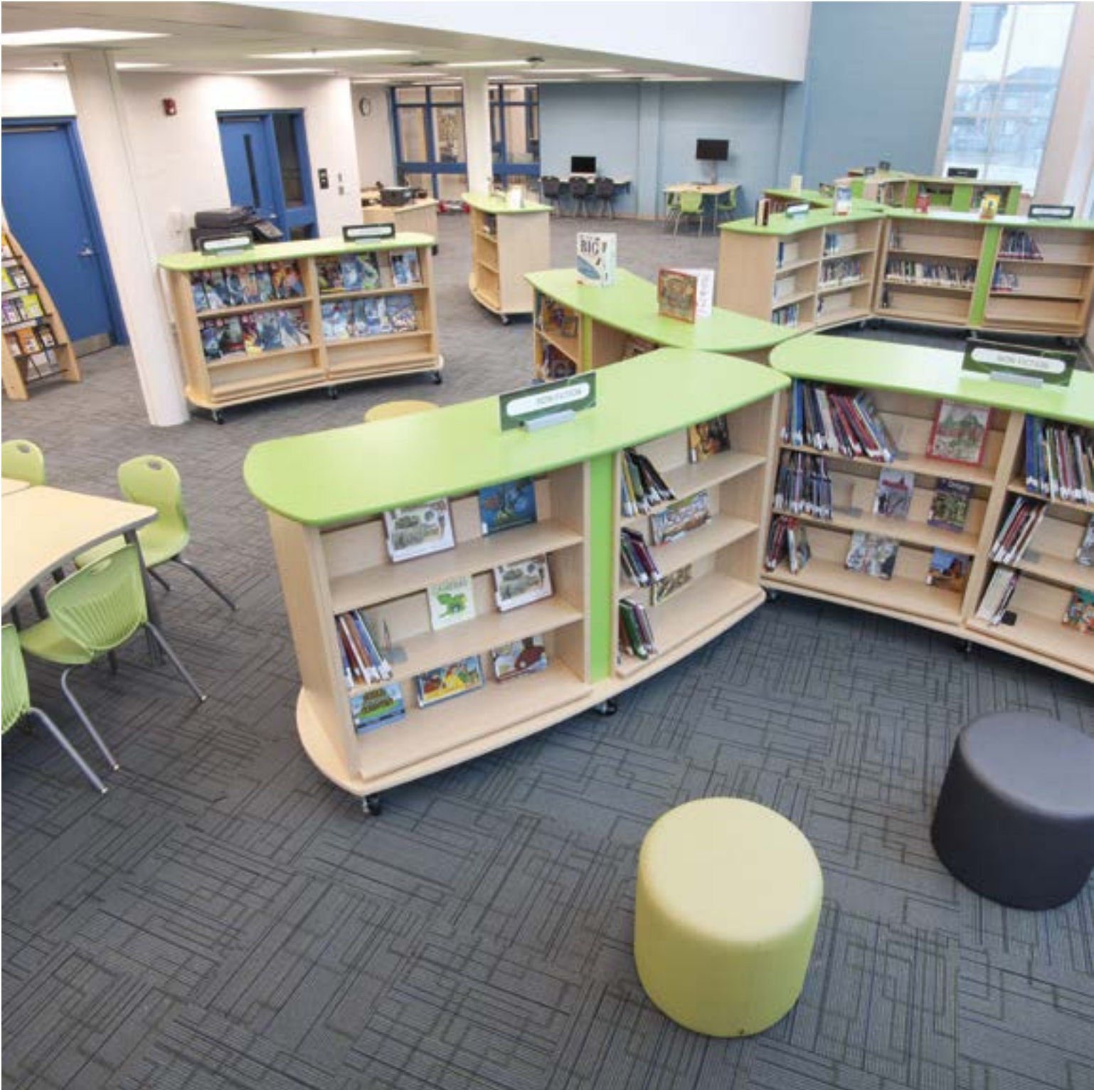
Brodart Contract OTB Performance mobile shelving with Artcobell Discover tables and chairs and HON Flock ottomans.