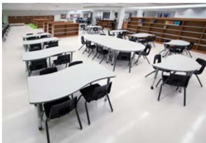
Artcobell Discover shaped tables with Uniflex stacking chairs.