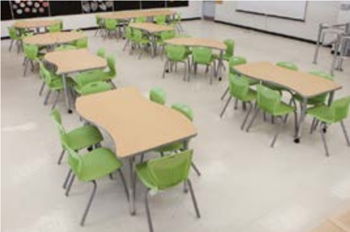
Artcobell Discover Expanse and Nebula shaped tables with Discover chairs.