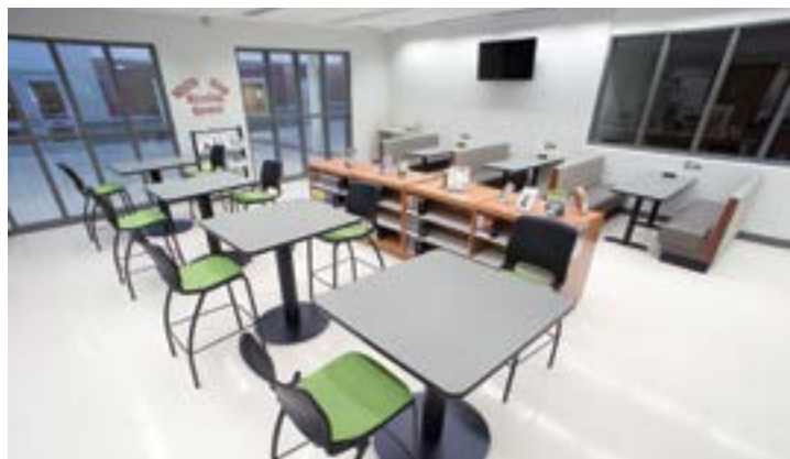
Bretford Explore cafe tables with HON Motivate stools.