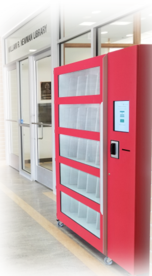
University of Manitoba's NovelBranch pictured with the custom card reader option.

125 books, 5 shelves 12" screen 80 mm thermal printer 100-240V input voltage 503 D X 1351 W X 1920 H mm RFID: ISO15693, 18000-3-1 RFID data models: ISO28560, Danish Patron card: barcode, Mifare Pin code entry: touchscreen Network Connectivity: TCP/IP ILS Connectivity: SIP, SIP2