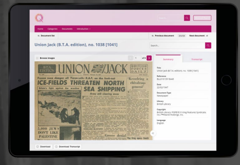
exhibit your content