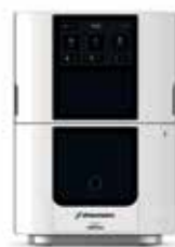
CARES® P30+ (Automatic Separation for Continuous Printing)