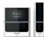
CARES® P wash