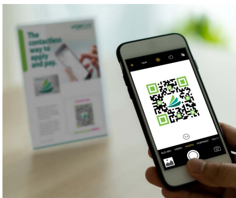
QR code and display