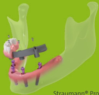
Straumann® Pro Arch

A unique portfolio of materials to provide patients and the restorative team with an unparalleled range of treatment options can be provided to you through in-house or by outsourcing. You can select the services you want, and Straumann delivers everything needed for the treatment in one box.