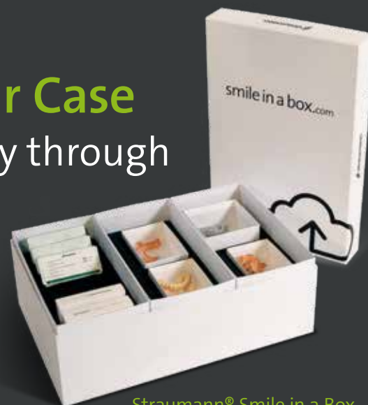
Straumann® Smile in a Box

Increase your efficiency in the planning and placement of implants with an integrated digital planning solution. This solution helps you grow your patient acceptance, simplifies ordering and inventory and saves chair time.