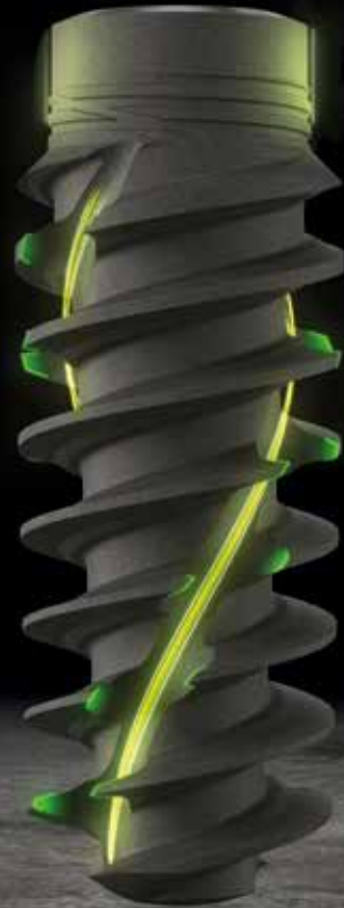
Straumann® BLX Implant System

A complete range of integrated regenerative solutions with predictable positive outcomes for all biological situations and indications.