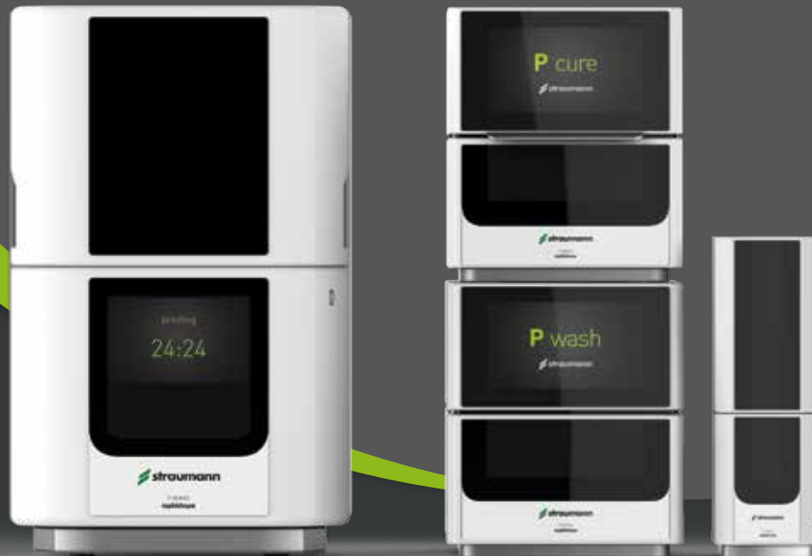
Straumann® P series