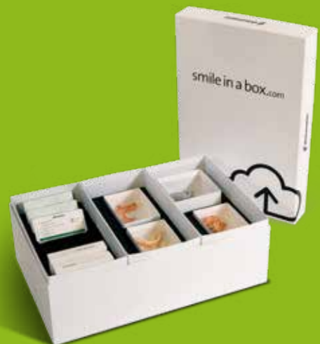
Straumann® Smile in a Box