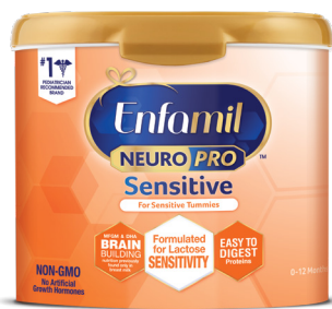
Enfamil NeuroPro™ Sensitive