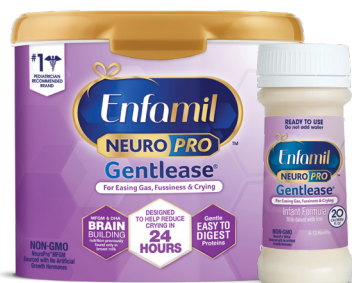
Enfamil NeuroPro™ Gentlelease®