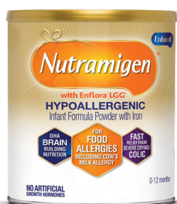
Nutramigen® with Enflora™ LGG®11