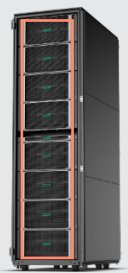
32 sockets (up to 48 TB † )

* 12-socket, 24-socket, and 28-socket configurations not pictured