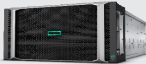
HPE Superdome Flex 4-socket, 5U Modular Building Block