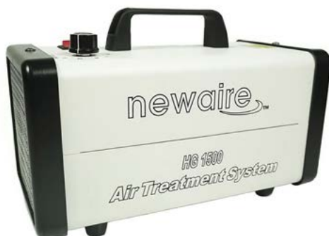
Air Purification Systems

Unlike ozone and UV technology, Hydroxyl Air Treatment Systems are safe to use in occupied spaces!