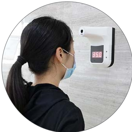
Mount on the wall