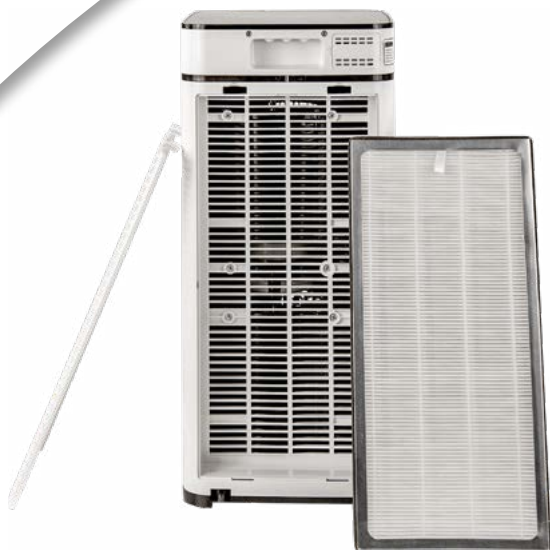
Air Purification Systems