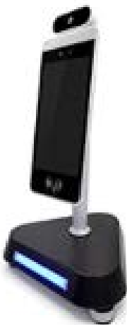
Table top mount