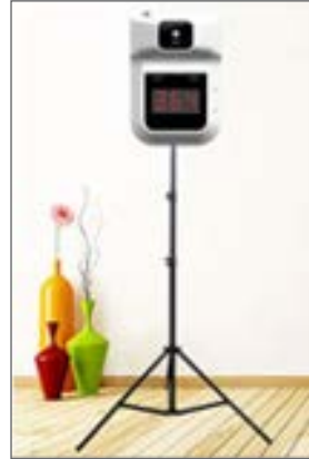
Fixed on the bracket