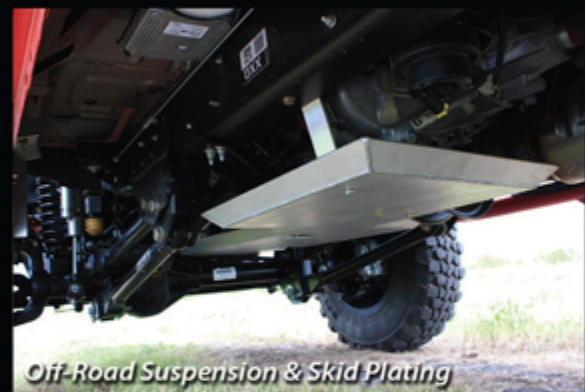
Off-Road Suspension & Skid Plating