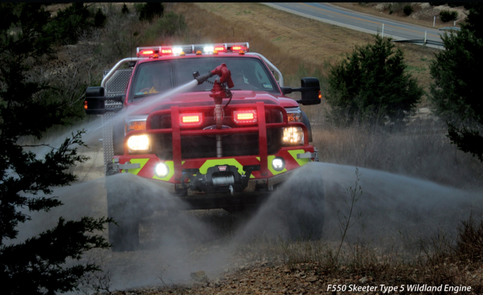
F550 Skeeter Type 5 Wildland Engine

Skeeter Brush Trucks were designed with the collaboration of wildland firefighters and engineers. Our solution is a true custom wildland apparatus manufactured to NWCG standards. We put emphasis on protecting the chassis and body through reinforcements and armor to take the personnel and equipment to the fire and fight offensively while minimizing manpower.