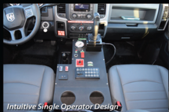
Intuitive Single Operator Design