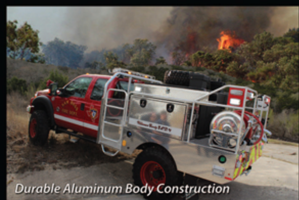
Durable Aluminum Body Construction

Strength, durability and flexibility. Each body design is engineered for proper strength, weight, and balance in either a 92" or 96" wide model and designed for 20 years of extreme wildland service. Our bodies are built on a TIG welded aluminum substructure (5" I-Beam frame rails with 3" I-Beam cross-members on 12" centers). The bodies are then aluminum skinned and spring-mounted to the chassis frame to allow for strength and flexibility. Skeeter Brush Trucks have been pump tested at sea level up to 12,000 ft. to ensure reliable performance. Each body is NFPA flex tested in all attitudes while flowing water to all discharges to ensure our quality standards and design are properly met.