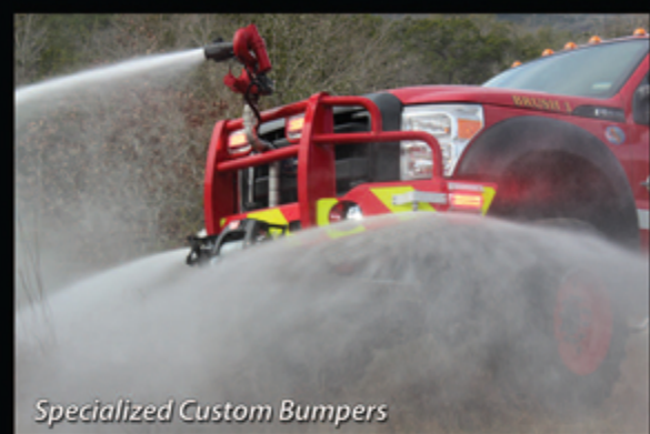
Specialized Custom Bumpers