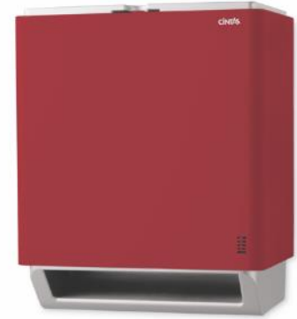
PAPER TOWEL DISPENSERS