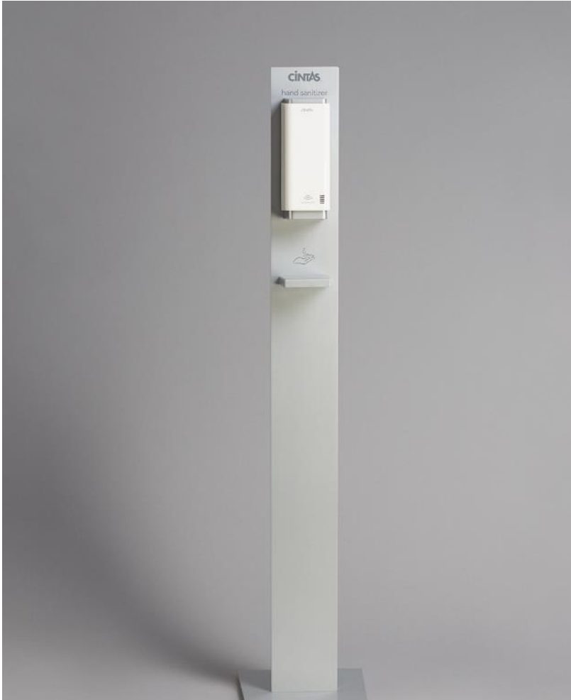
DISPENSERS & STANDS

Provide peace of mind with touch free restroom dispensers.