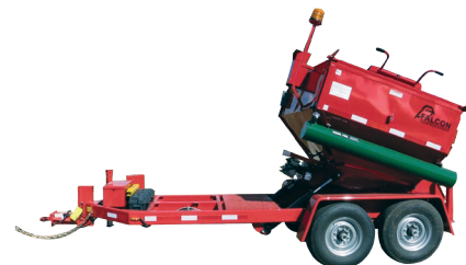
ASPHALT HOT BOX AND RECYCLER

Falcon Asphalt Repair Equipment 2600 W. Salzburg Rd. Freeland, MI 48623 sales@falconrme.com