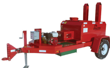
TACK TANK TRAILER