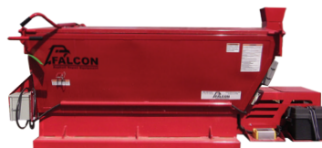
SLIP IN MODEL