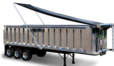
Easy Cover® Coal Bucket Model 555