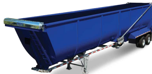
Easy Cover® Scrap & Demolition Model 595