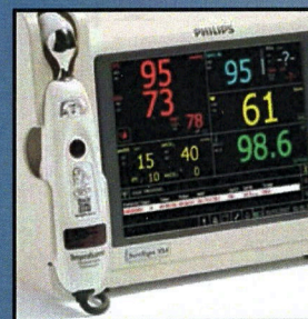
Philips SureSigns VS4