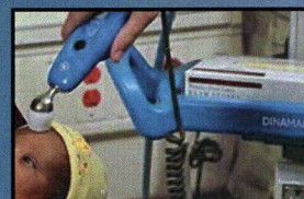
GE Healthcare VC150, V100, Corometrics

Invented, Designed, Assembled, Calibrated, Tested, and Packaged in the USA by Exergen