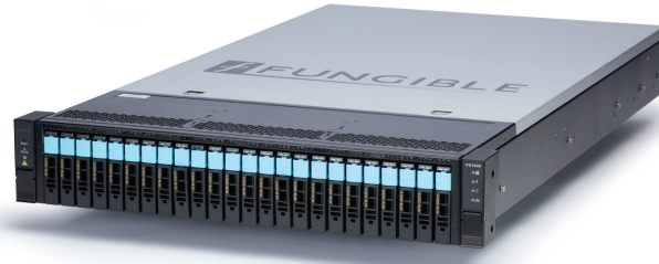
FS1600 High Performance Storage Node

Disaggregated, Pooled Storage: At local NVMe drive level performance.