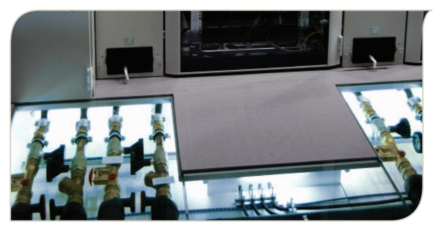
Reliable quick disconnect couplings play a significant role in liquid cooling systems that mitigate heat generation at the source.