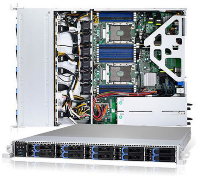
Figure 1: Thunder SX GT62H-B7106 - 1U All-Flash Dual Socket Storage Server

As shown in Figure 1, an excellent starting point for a High-IO computing system is the TYAN Thunder SX GT62H-B7106 platform. As part of TYAN's leading Intel Xeon Scalable Processor-based storage product line, this 1U server provides many important features for high-IO computing including ten NVMe U.2 drive bays, dual Intel Xeon Scable