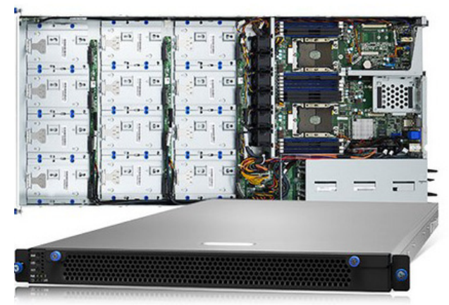
Figure 2: Thunder SX GT93-B7106 - 1U Density Storage Server with 12 Internal 3.5" SATA 6G Drive Bays and dual socket Intel Xeon Scalable Processor

As mentioned Big Data (and database) computing requires both high performance and bulk storage. The best cost-per-byte of storage is still with the 3.5-inch spinning disk drives. The TYAN Thunder SX GT93-B7106 chassis provides a solid platform to create or grow a Big Data computing system. Featuring dual socket Intel Xeon Scalable Processor support with up to 2TB of DDR4-2933 memory, twelve (12) internal easy-swap 3.5" SATA 6G drive bays, one internal 2.5" SATA 6G drive bay, one PCle x16 OCP (Open Compute Project) v2.0 dual-port LAN Mezzanine slot, one Low Profile PCle x16 slot, and (1+1) 650W redundant power supplies.